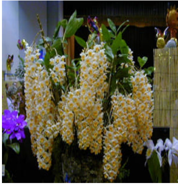
Dendrobium thrysiflorum shown by Eddon Orchids.