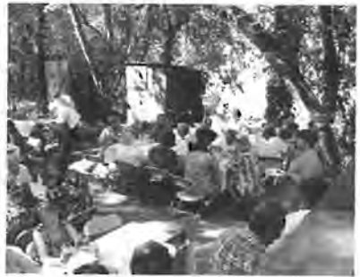
Enjoying the wonderful potluck and barbeque.