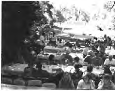
Socializing before the barbeque.