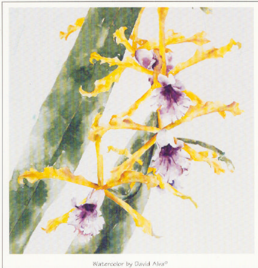
Watercolor by David Alva®

Saturday, January 6, 2001 - 10:00 AM - 5:00 PM