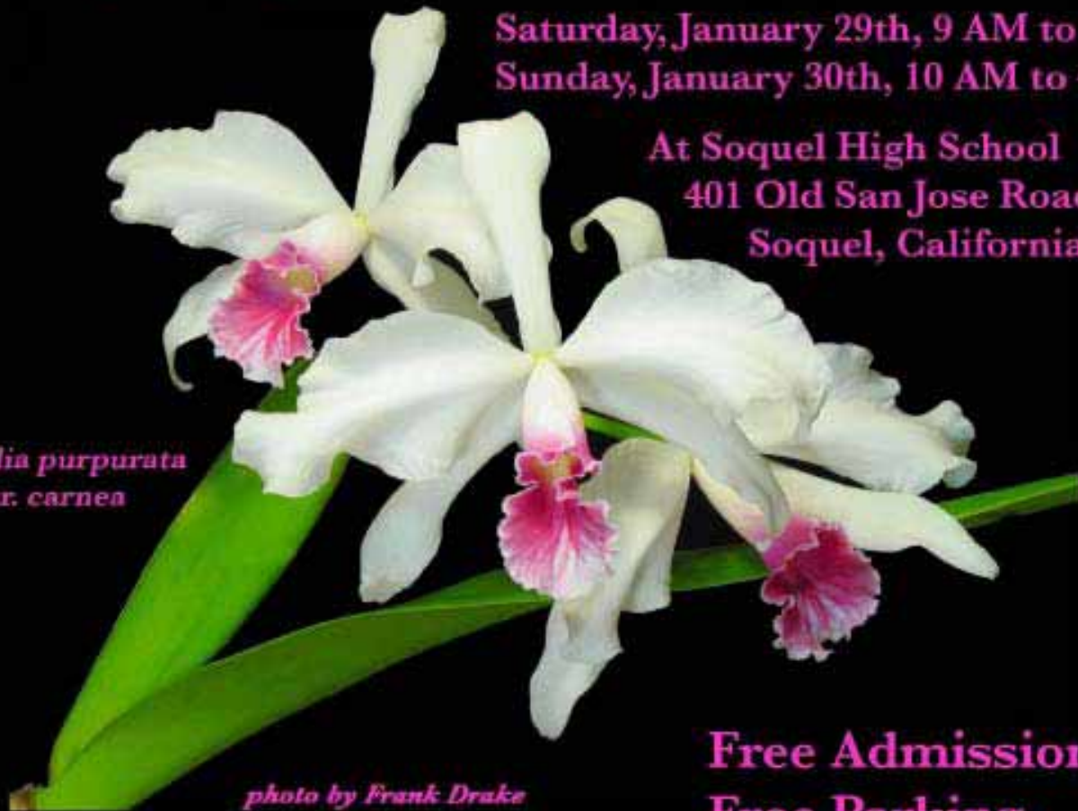
Laelia purpurata var. carnea

At Soquel High School 401 Old San Jose Road Soquel, California